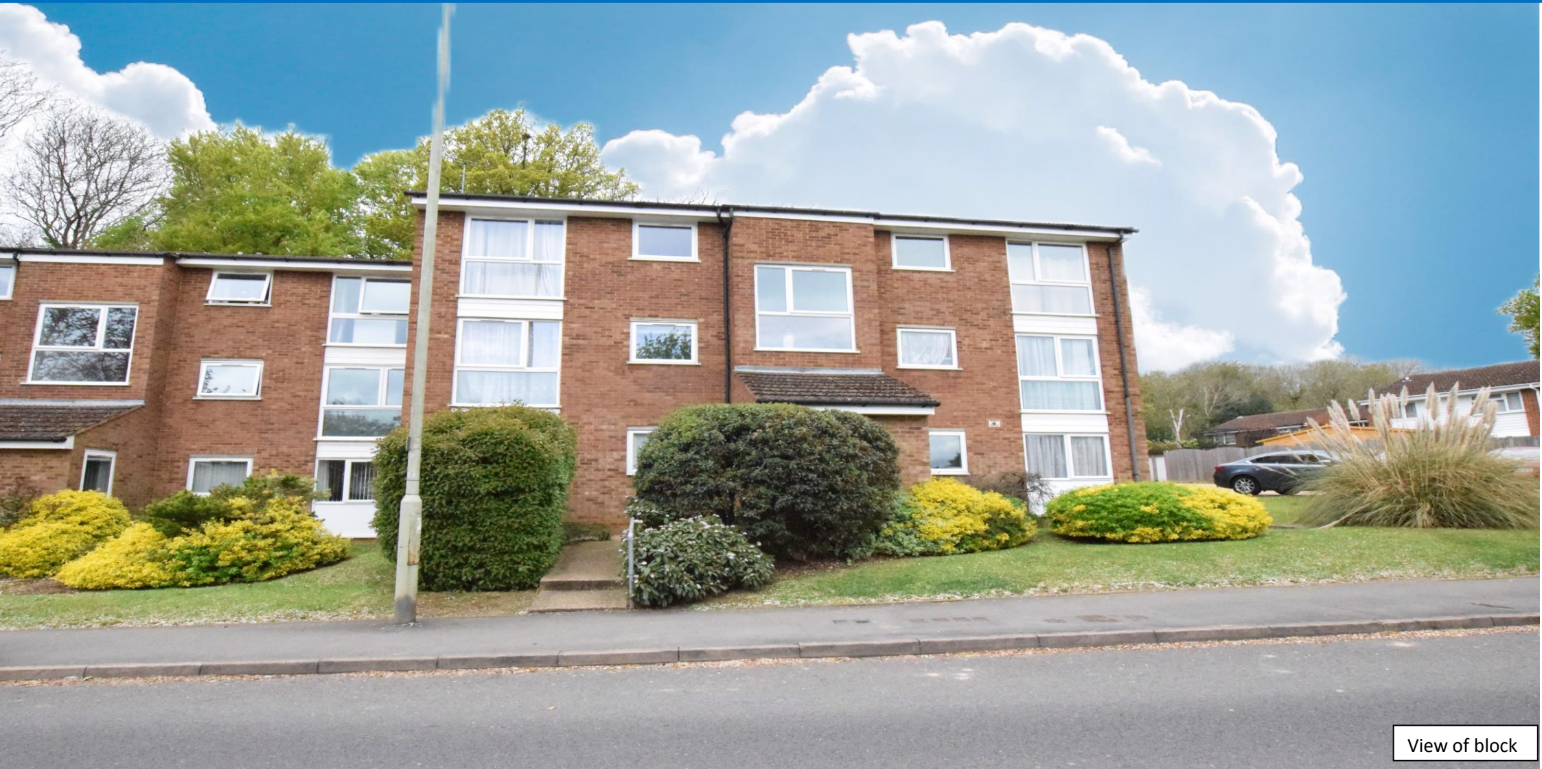
View of block